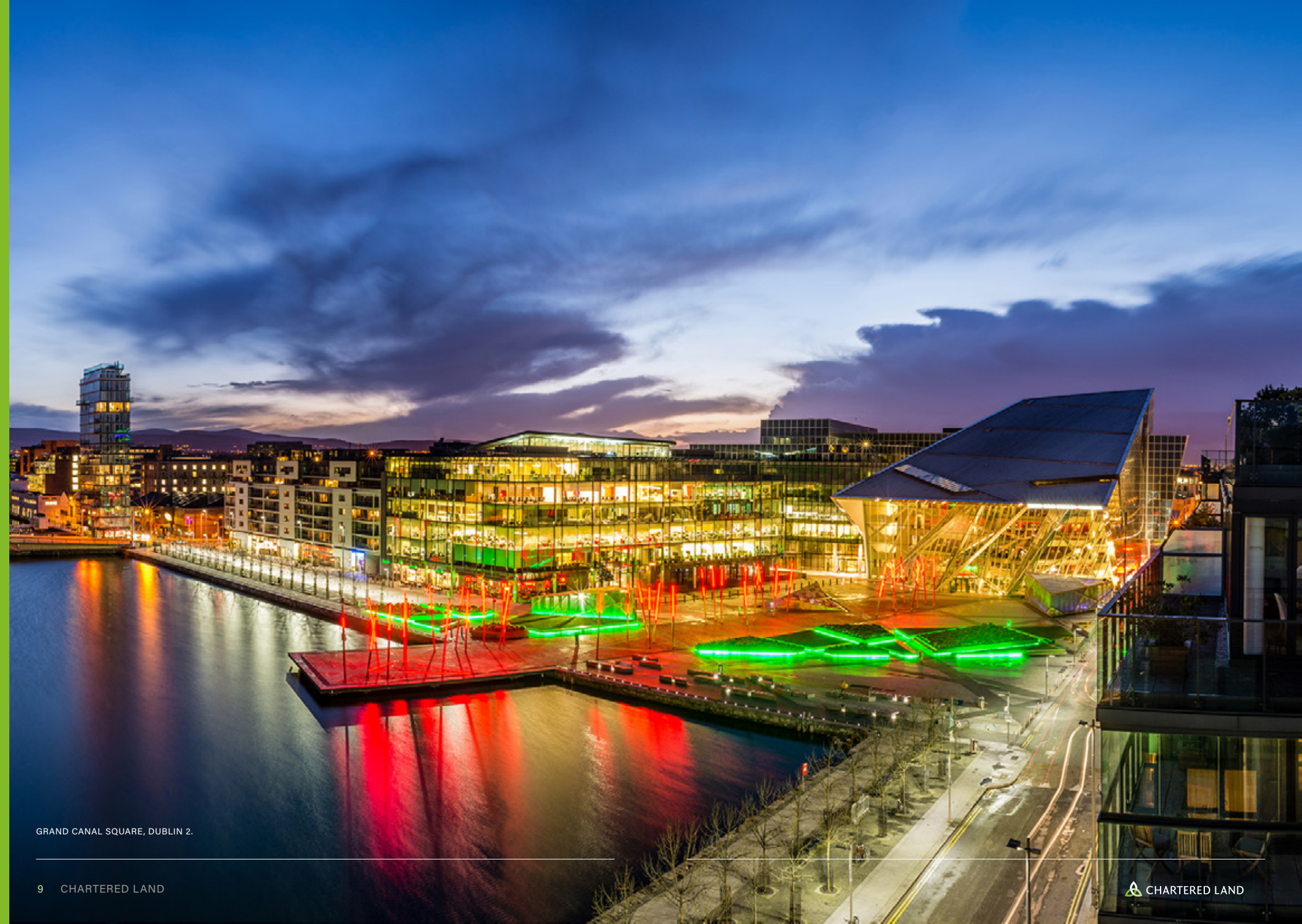
GRAND CANAL SQUARE, DUBLIN 2.